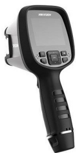
Body temperature measurement camera